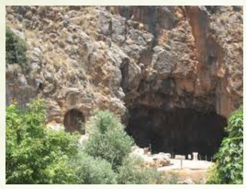
The Rock at Cesarea Philippi also known as the Gates of Hell

If we are going to be "Empowered to Win Many in 2020," then 2020 must be a year of clear vision. I'm not talking in the natural. I'm not talking about casting vision for your church, I'm talking about receiving vision in your soul. I'm not talking about natural plans and dreams and best practices. I'm