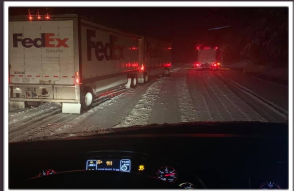
Princeton Church of God, being the hands and feet of Jesus Passing out salt to Semi trucks and cars stuck on the hill between Oakvale and Princeton.