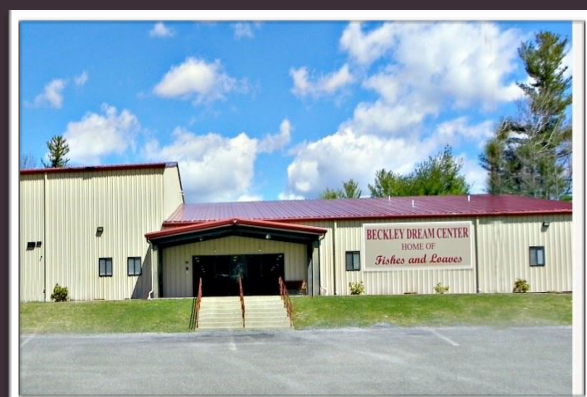
Beckley Dream Center feeding the hungry both physically and spiritually, with 2 mobile distributions and one drive thru.

We would like to highlight your church on our Church News page. Let us know what is happening at your church, what your church is doing in the community to make a difference.