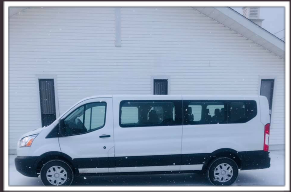
Beckley Church of God received a donation of a new church van.