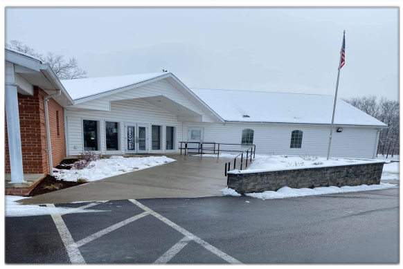
Crosspoint Church of God feeding 422 people in the Eastern Panhandle.