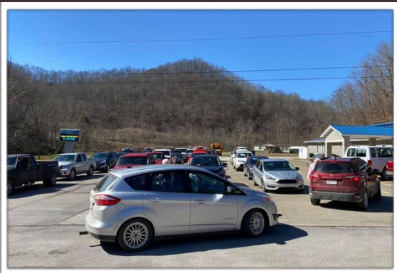
Fountain of Life Worship Center, Foster, WV distributed 200 Food Boxes at a recent food giveaway.